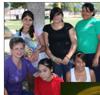
These are just a small glimpse at the more than 1600 kids you helped with school supply kits!